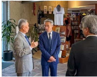
Meeting George Takei at the Japanese American National Museum