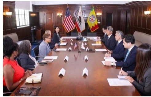
Meeting with LA Mayor Karen Bass