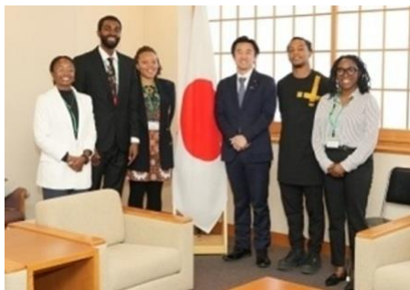
Meeting with Parliamentary Vice-Minister for Foreign Affairs Hosaka