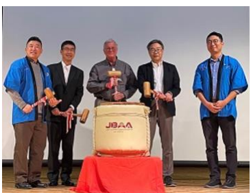
Japan Business Association of Arizona New Year's Celebration (Jan. 20)