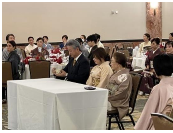
Urasenke Tankokai Los Angeles Association Hatsudate Shiki (Jan. 14)