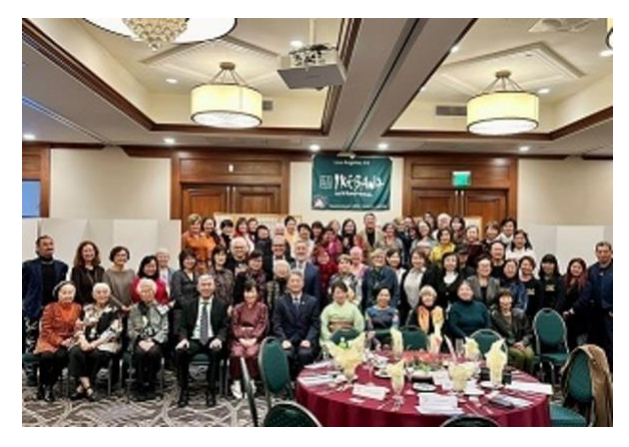
Ikebana International Los Angeles Chapter #4 New Year's Luncheon (Jan 7)