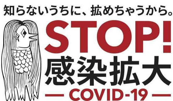
Amabie

News. The findings, a major discovery, were also published in the journal Nature. Click the title to learn more about the team's findings.