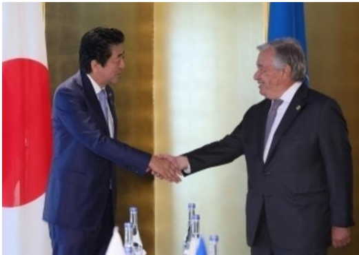
At a Aug. 2019 meeting

to address the COVID-19, economic measures and continued collaboration between Japan and the EU.