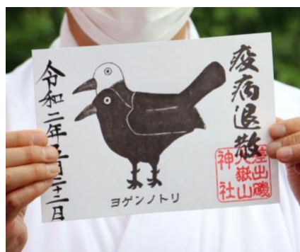
Yogen no Tori