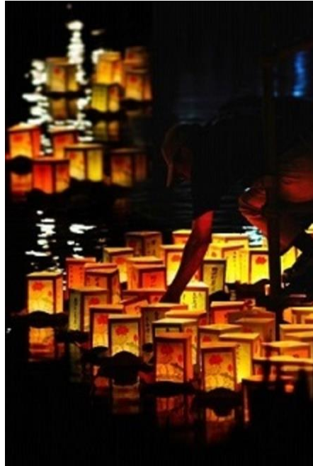
Lanterns to send off spirits