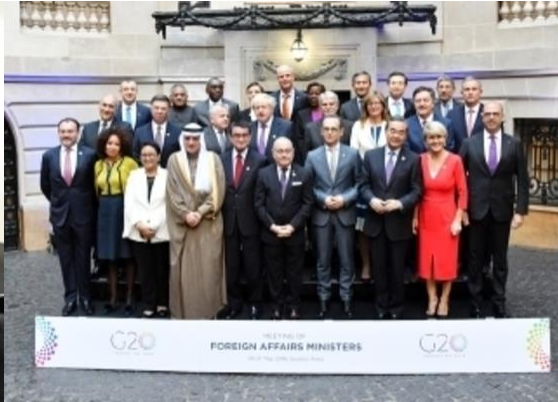
G-20 Foreign Ministers' Meeting