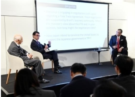
Japan House São Paulo

Japanese Foreign Minister Taro Kono's whirlwind May 19-26 tour of the Americas included a stop in São Paulo, Brazil to visit a Japan House outpost and a visit to Buenos Aires, Argentina to attend the Group of 20 Foreign Ministers' Meeting.