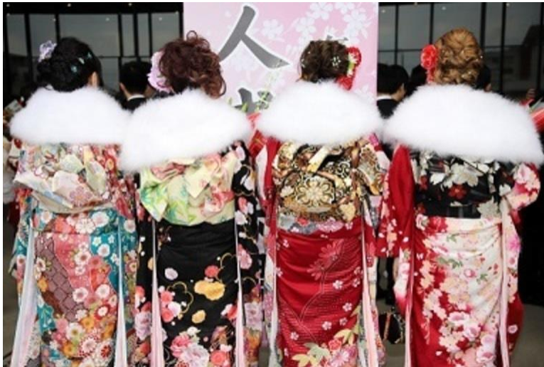
Women in furisode

Seijin Shiki coming-of-age ceremonies are held by different organizations in Southern California as well, keeping alive this Japanese tradition outside of Japan.